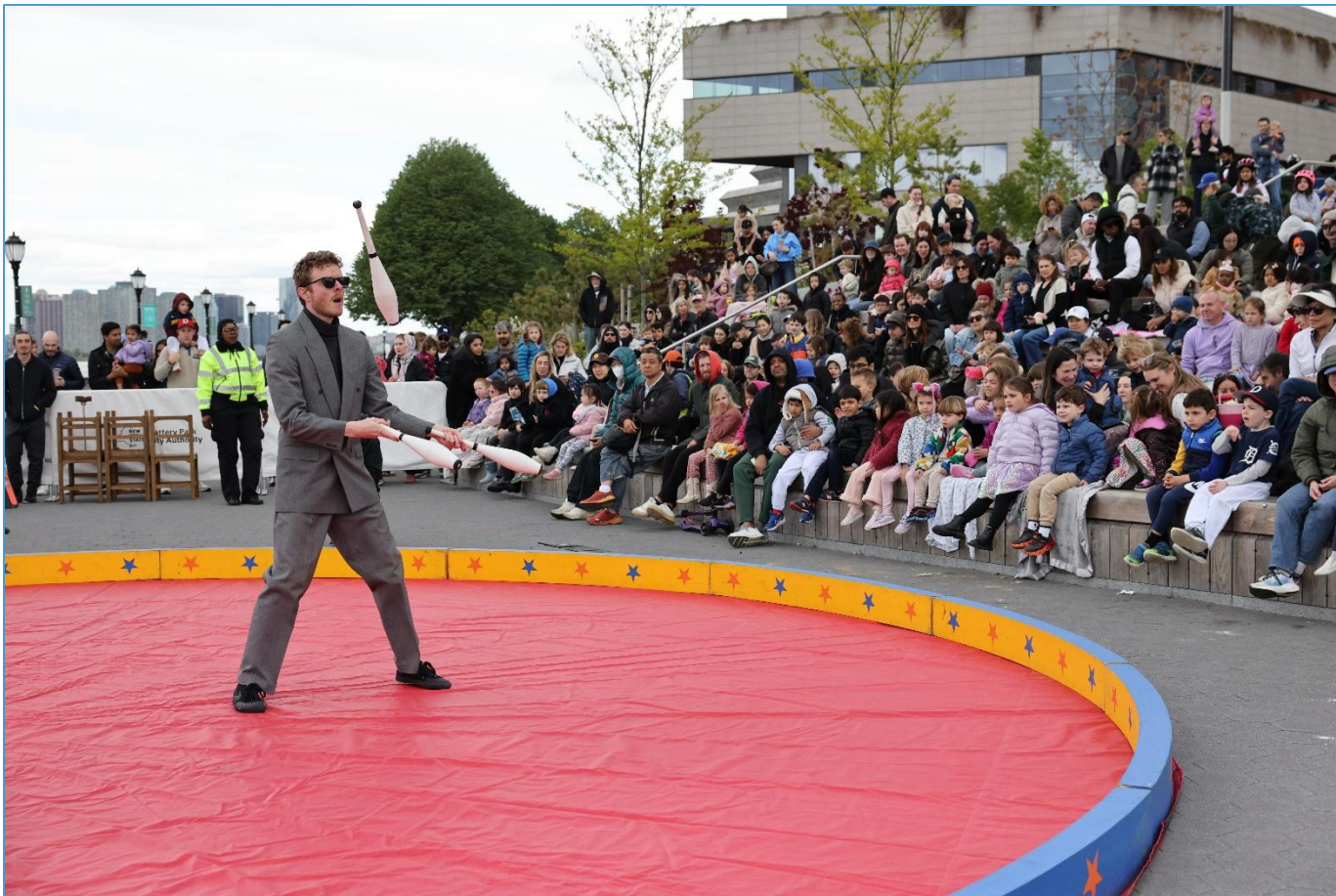
A LOT TO HANDLE IN BPC: A performer with the Bindlestiff Family Cirkus wows the packed crowd at Wagner Park as Battery Park City's free summer programming season kicks off on Saturday, May 2, 2026.