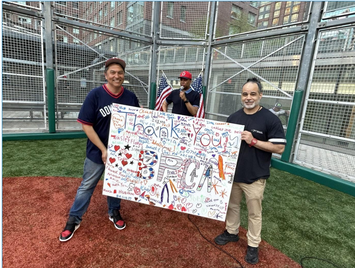
GRAND SLAM: The Battery Park City Authority hosted Downtown Little League and local elected officials on Friday evening, April 17, to mark the start of little league season at the newly-renovated BPC Ball Fields.