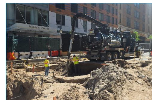
Excavation of electrical trench for Chamber Street tide gate chamber