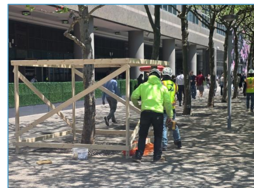
Tree protection at North Cove Marina