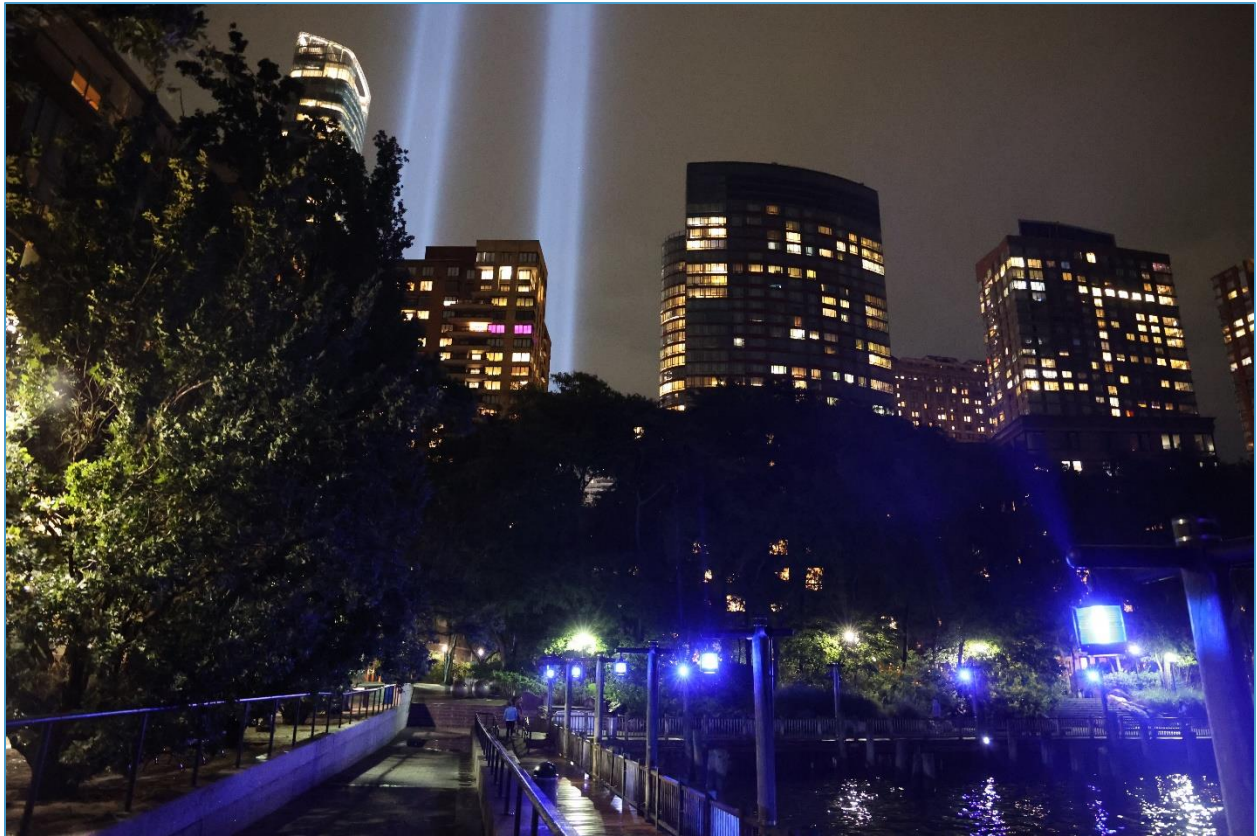
NEVER FORGET: The 9/11 Memorial & Museum's annual Tribute in Light as seen from Battery Park City's South Cove on the evening of September 11, 2023.