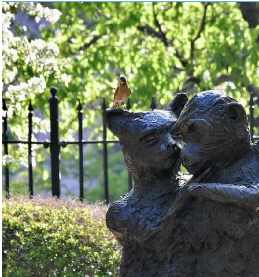
PUBLIC ART HAVEN: A visitor perches atop Ape & Cat (At the Dance) in Rector Park East. Battery Park City is dotted with an array of permanent and temporary public art works. Tune Into Public Art on Video: Season 2 for more about the collection by the artists who created it.